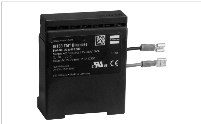
INT69 TM Diagnose